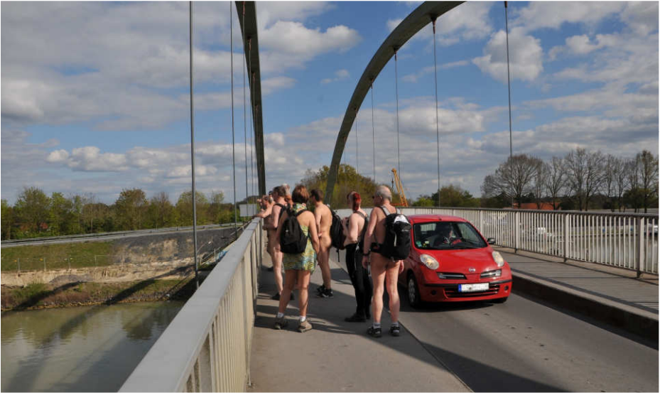
Naturists' days in Westphalia 2017, Germany, 29 April to 1 May 2017