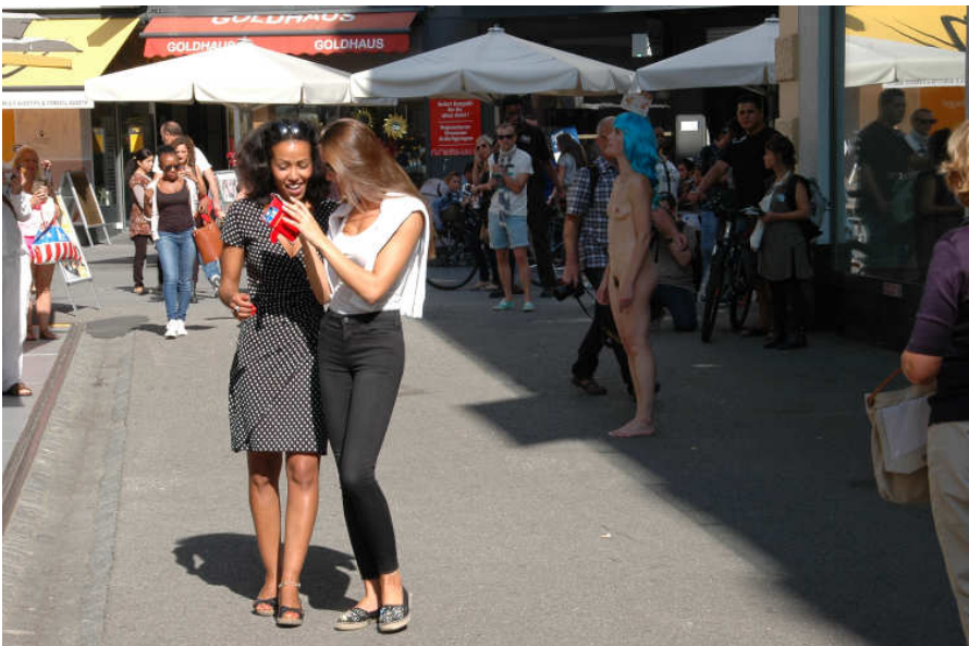
Festival „Body and Freedom – Naked Performances in Urban Space“, Schweiz / Suisse, Biel / Bienne, 2015-08-21..22