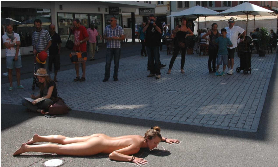
Festival „Body and Freedom – Naked Performances in Urban Space“, Schweiz / Suisse, Biel / Bienne, 2015-08-21..22