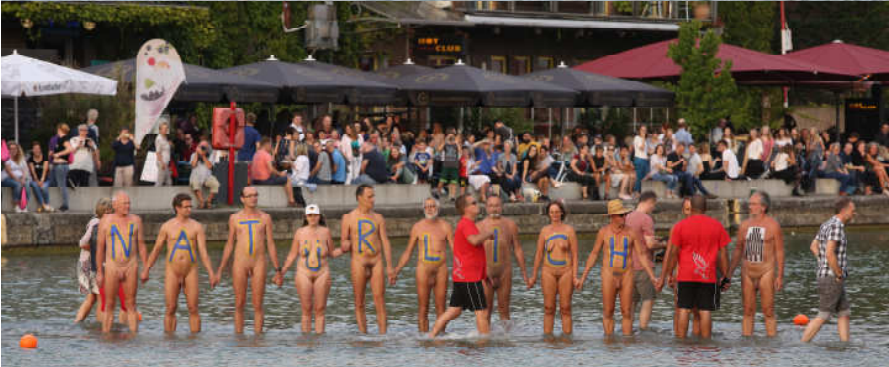
Festival „Skulptur Projekte Münster 2017“: Art work „On Water“ by Ayşe Erkmen, Berlin and Istanbul, BodyArt performance by the Initiative of Active Naturists gifted to the people, Münster (Westphalia), Germany, 26 August 2017, © Thomas Kruse