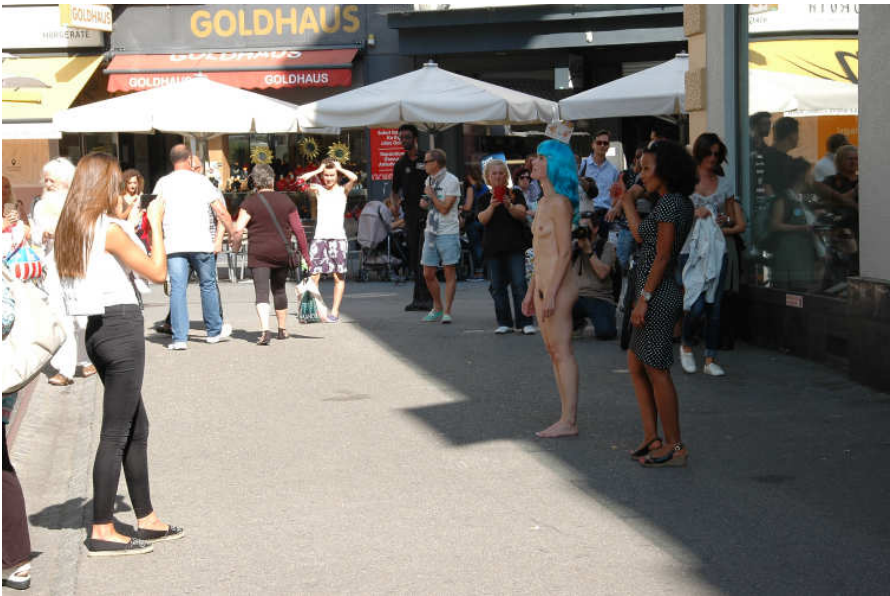
Festival „Body and Freedom – Naked Performances in Urban Space“, Schweiz / Suisse, Biel / Bienne, 2015-08-21..22