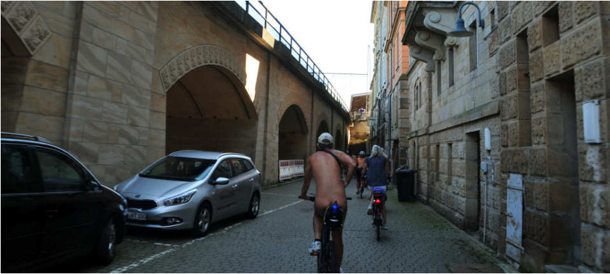
Naturists' days in Saxon Switzerland 2017, Saxon, Germany, 7 to 17 August 2017, © Horst Jerina