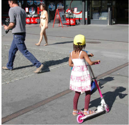
Festival „Body and Freedom – Naked Performances in Urban Space“, Schweiz / Suisse, Biel / Bienne, 2015-08-21..22