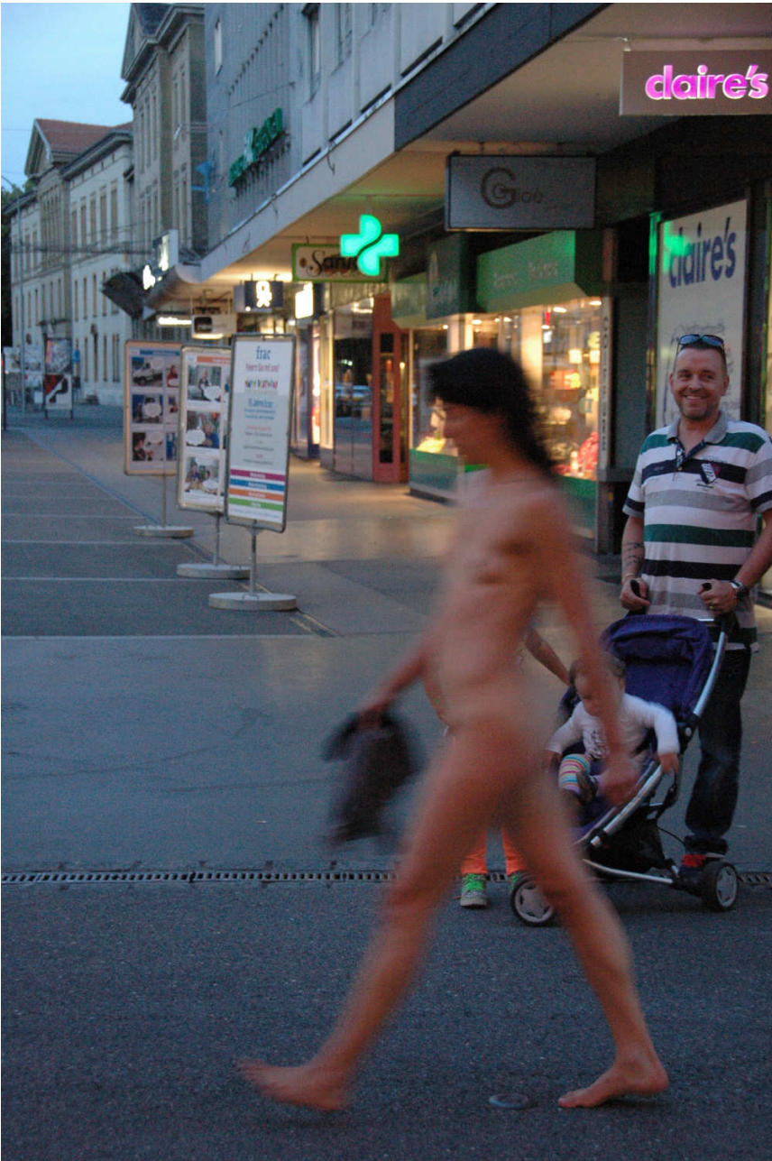
Schweiz / Suisse, Biel / Bienne, 2014