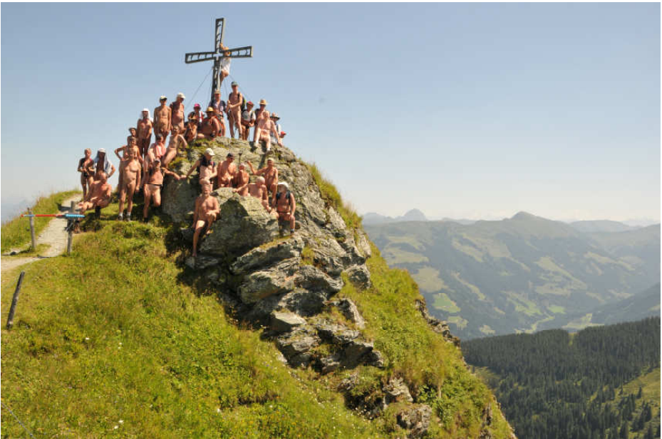
Naked European Walking Tour (NEWT) 2017, Wildschönau valley, Tyrol, Austria, 29 July to 5 August 2017